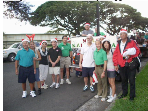
The gang helps the Jaycees celebrate Christmas