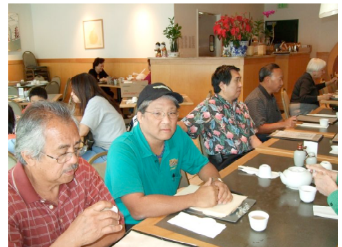
We always end up eating