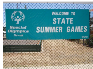
Over 2000 athletes participated!