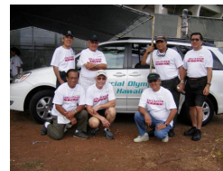
Da gang's all here