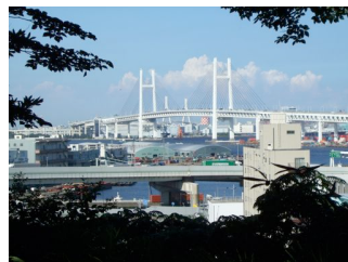
Yokohama Harbor Bridge