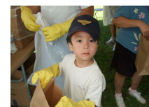
Our newest member!