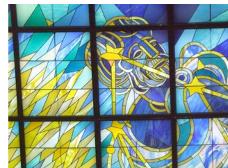
Stained Glass at Pacifico Center Entry for student art contest