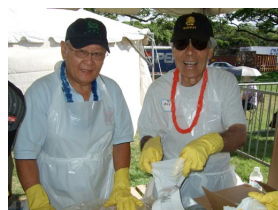
The two Roys hard(ly) working

Scenes from the annual Okinawan Festival September 4-5, 2010