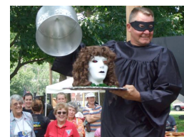
King Louis loses his head