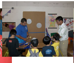
Troy lends a hand