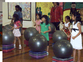
Who needs a drum?!