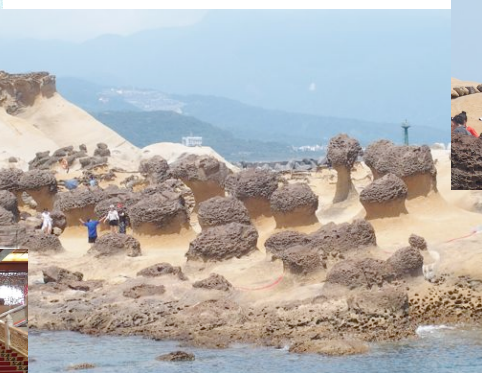
Yehliu Park with Queen's Head