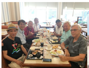
Breakfast at the Y Grand Hotel Taipei

Memories of the 72 nd Annual Y Service Club Convention, Taipei, Taiwan August 4-7, 2016