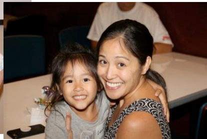
It's all about the kids!