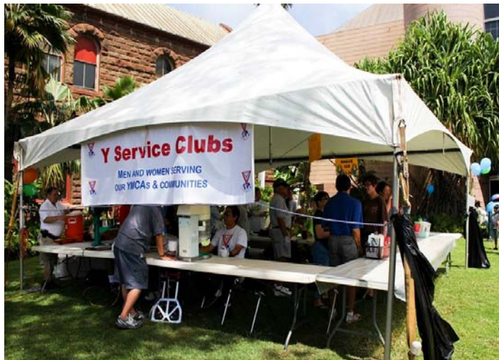
Metro District Y Service Clubs Shave Ice booth hard at work providing a cool treat for families at the Healthy Kids Day held at the Bishop Museum.