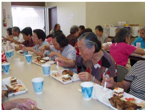
-100 th Bn Group Playing at Srs Dinner