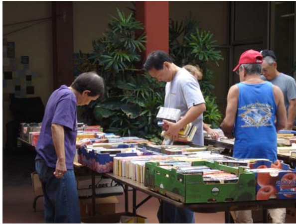
Serious buyers of books