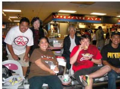
Eating is part of bowling!

The Fort Shafter bowling alley will be available to us on Saturday, March 27, 2010, as selected by the Kaimuki Y youth director. Now we need to hear from the Nuuanu youth group. They also have get back to us as to the time. It will be Cosmic bowling and as soon as the time is selected, I will promptly make reservations. Remember, no drinks or food can be brought in. Our Club will pay for the games and shoes rental for the youths. Club members are also encouraged to attend to cheer them on.