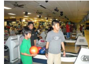
Ready to Bowl

The Nuuanu Y's Up Club Bulletin can be viewed at the www.ysmenusa.com website. Go to Hawaii Region, Nuuanu Y's Men's Club link *****