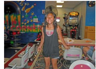
I got a Strike too!