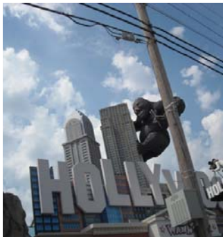
King Kong on the buildings