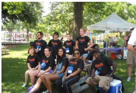
Youth Convocation Participants.