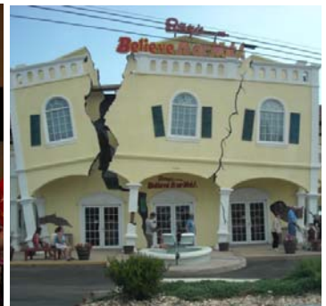
Earthquake Building in Branson