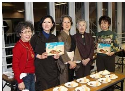
(Our best Y's menettes team in the Y'sdom)