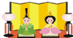
(The Girl's doll festival — March 3 rd )