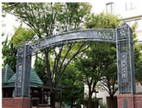
(The entrance arch of the Osaka J. University)

Her another life changing experience came in 1998, when she went to the Osaka Jogakuin University to have an interview. At the entrance arch of the university, she found her most favorite biblical message; "The fear of the Lord is the beginning of wisdom," which made her decide to stay rather than leaving this country. What she told us was like spiritual messages came from her life experiences and we are deeply moved with much interest.