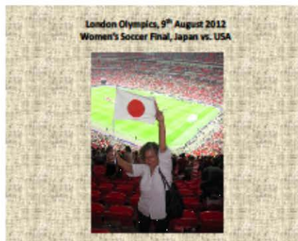
(At the women's soccer final match in London)

When she is often asked here which of these 3 countries – SL, UK or Japan you have so far lived you like the most, she answered that Sri Lanka is her mother, UK her father and Japan her soul-mate.