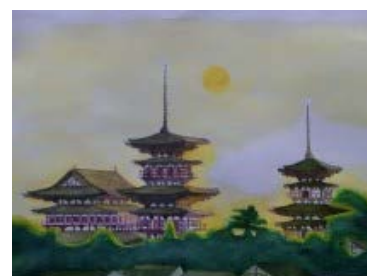
CONGRATULATIONS, SAM! Beautiful Art!