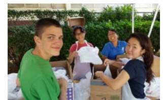
More Chicken Sale pictures on page 3

Thank you to EVERYONE who came out to help and who bought and sold sushi and chicken!!!