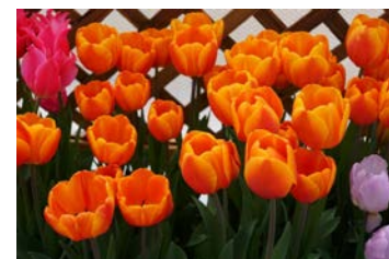
Kireina hana desune!